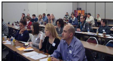
Attendees at the OAFP Winter Meeting

The Annual Meeting was followed by a short Executive Board Meeting. OAFP's summer meeting and tour are planned for July 2011.