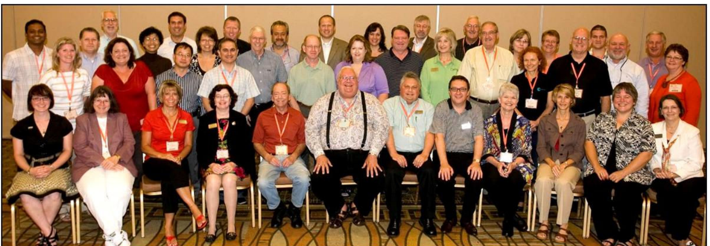
IAFP 2010 Affiliate Council meeting